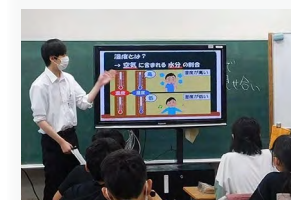
A scene from an on-site lecture

We engage in various activities, including "on-site lectures," given by our employees at nearby elementary schools, accepting social studies tours by elementary and junior high school students, and accepting high school students interested in the electrical and electronics industry for internships, as well as tours of Group company plants where home appliances are recycled.