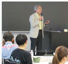
A scene from an external seminar

In addition to promoting the health of employees, we also support the families who support our employees, as well as businesses and organizations that aim to introduce health and productivity management. We will realize our corporate philosophy of “—living together for our future—” by contributing to local communities and providing support to our stakeholders.