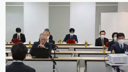
A scene from a Central Labor Council meeting

Based on a union democracy, our Group fully cooperates with Fujitsu General Workers' Union, which is striving to enhance labor-management communication at all levels in order to make Fujitsu General Group a more "attractive, trusted, and reliable company" in the eyes of customers, society, and union members. At the same time, we are striving to maintain and improve sound and good labor-management relations through constructive dialogue based on mutual respect.